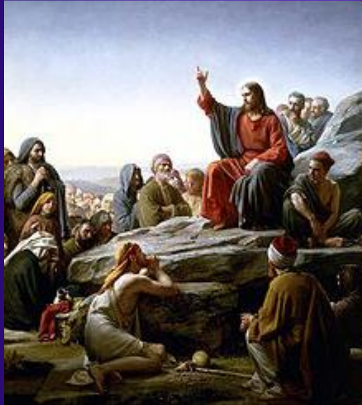
Sermon on the Mount